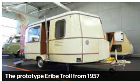
The prototype Eriba Troll from 1957

The main part of the roof can be raised, giving