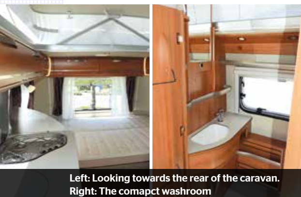
Left: Looking towards the rear of the caravan. Right: The compact washroom

A modern twist on the Eriba, showing the brand is ready for the next 60 years.